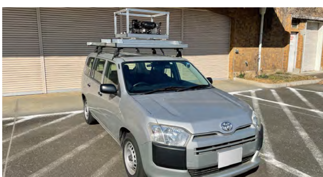
Onboard High-speed vision