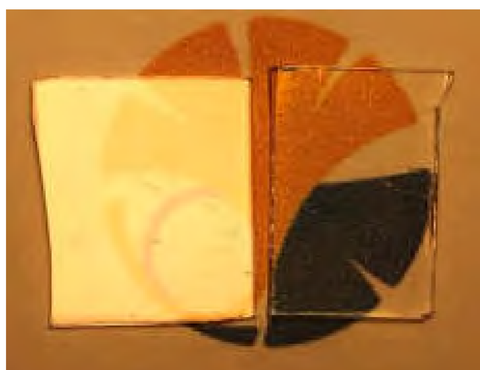
Reflection image of glass before (left) and after (right) surface treatment