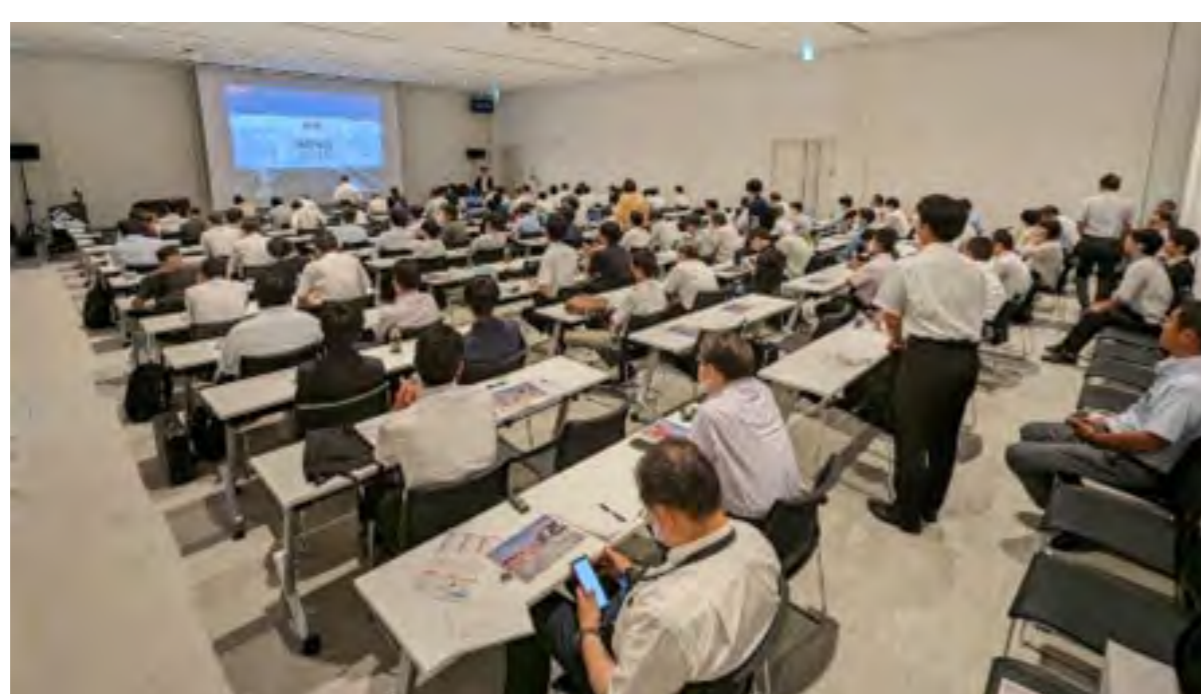
【ITS Seminar in Tochigi (Aug.2023)】