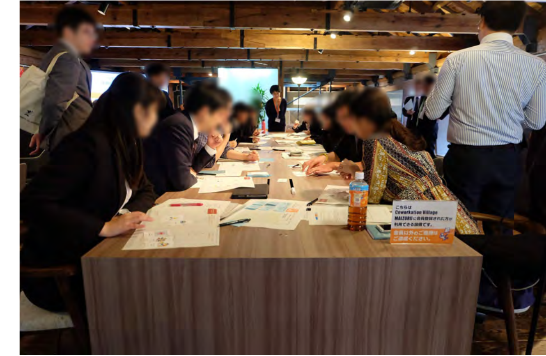
Held a WS for extracting latent issues by tools used in regional cooperation activities at IIS.