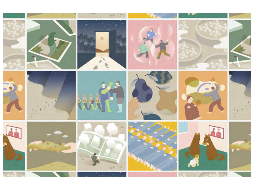
Held an Online WS for high school students across the country applying speculative design.