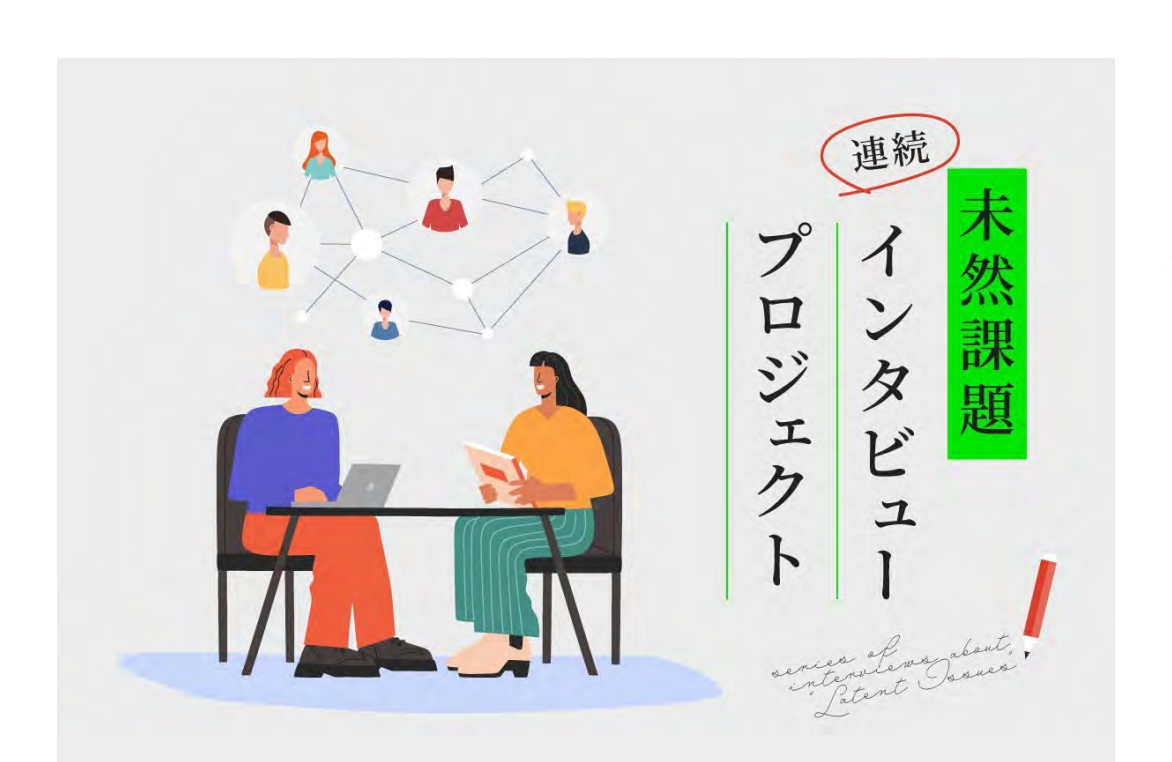
A series of interviews with IIS researchers on the common theme of "latent issues"