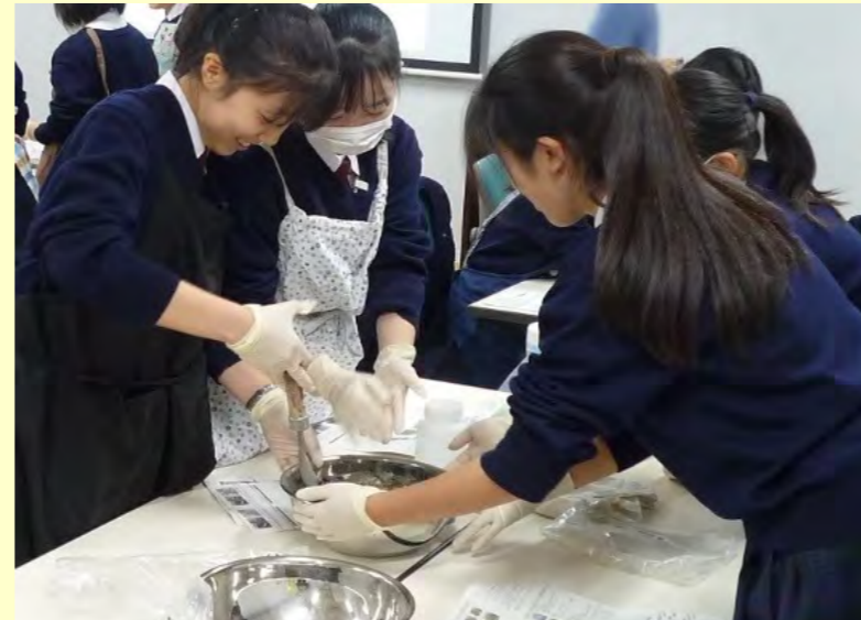
School Outreach Program