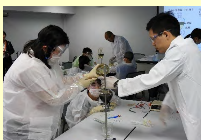
Open House of "KOMABA Research Campus" for Junior High and High School Students