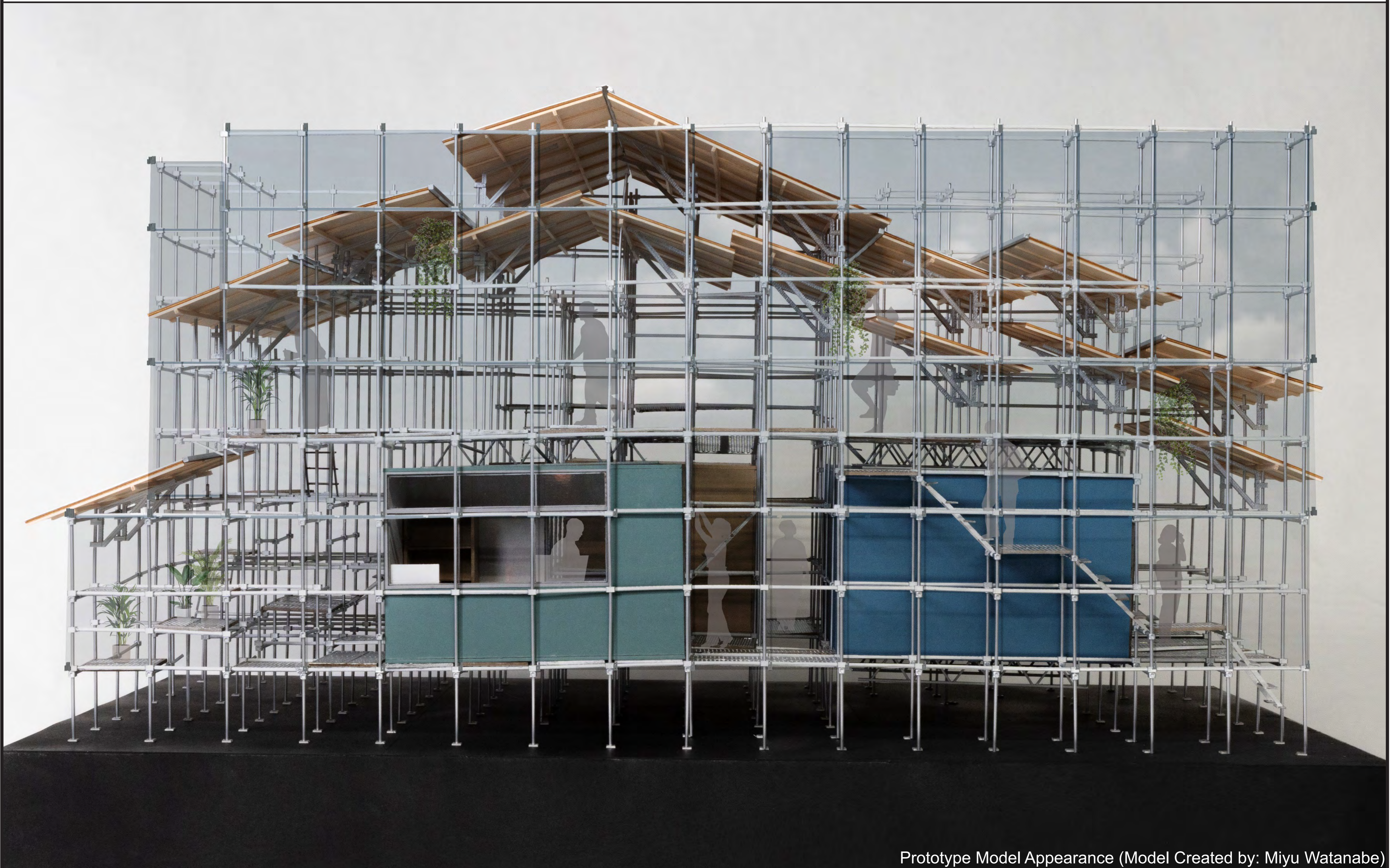
Prototype Model Appearance (Model Created by: Miyu Watanabe)