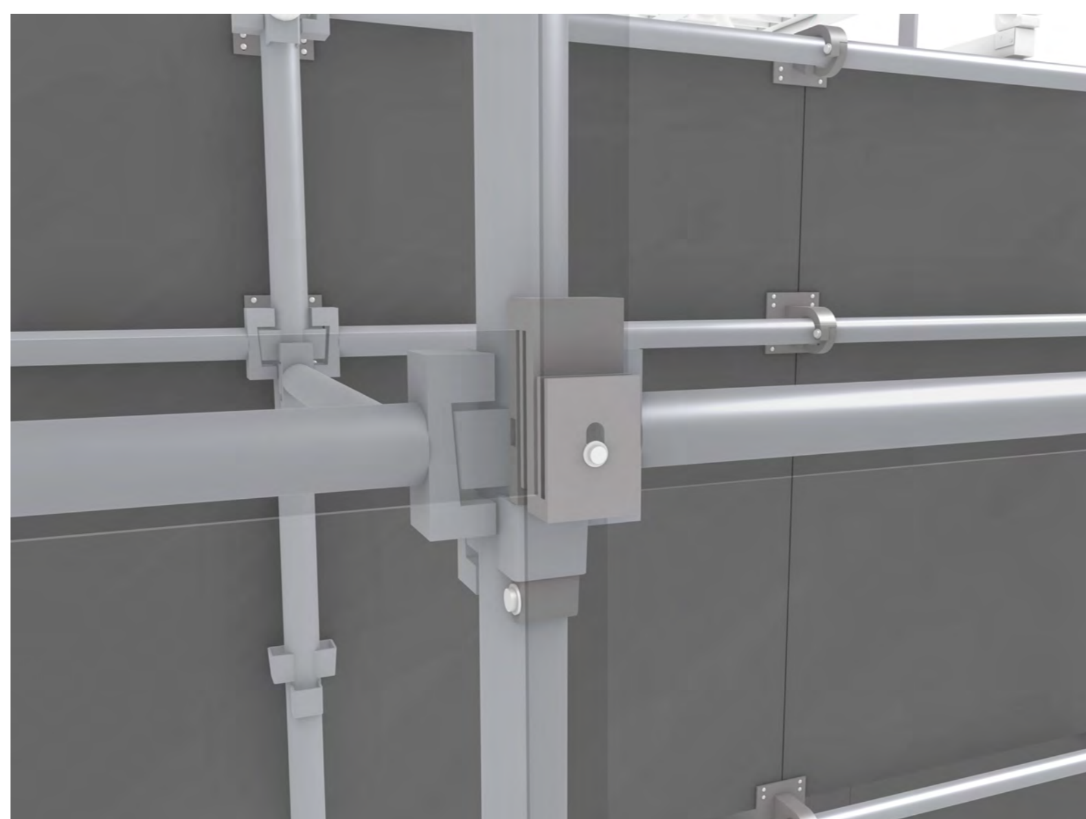
Joints for Fixing Exterior Wall Panels