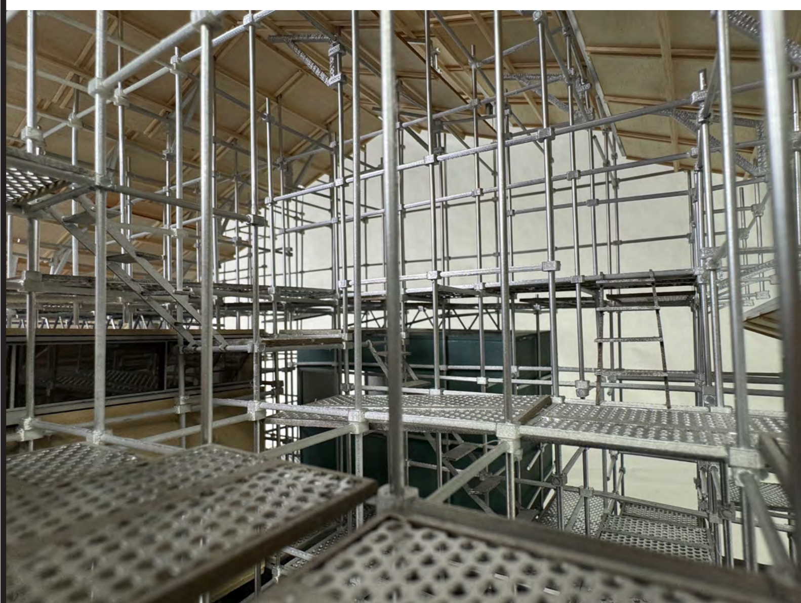
Interior View Looking Up at the Roof

This project focuses on the ease of spatial construction and removal of scaffolds and develops customizable joints to make scaffolds function architecturally. This will enable the scaffold to be used to install external walls, roofs, and foundations, so that the scaffold itself can serve as an architectural structure. The spatial system will also provide a function for humans to shelter from the elements, while inside there can be living spaces such as tea rooms. Construction of a full-scale prototype is underway, and usability checks are being carried out to improve the spatial system with the aim of implementing it in society in the future.