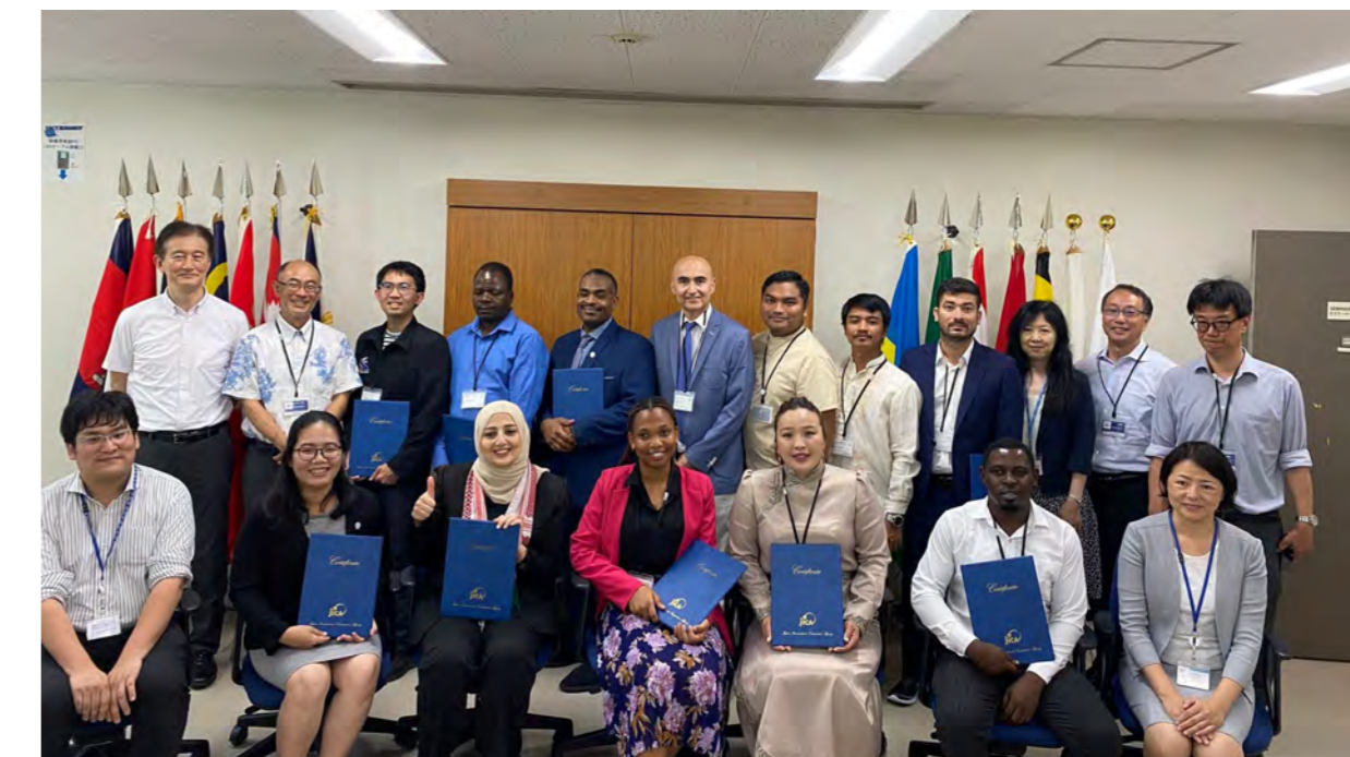
【JICA Program on ITS】