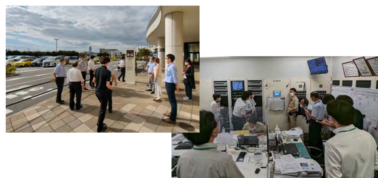
【RC-66 Field Survey】