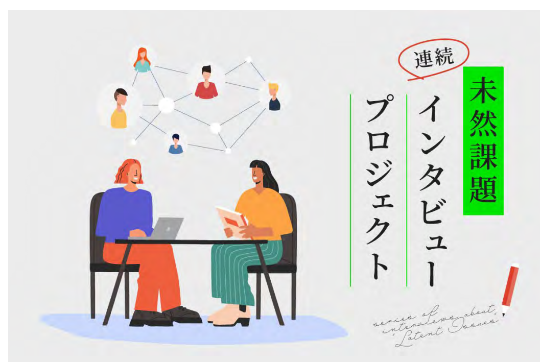
A series of interviews with IIS researchers on the common theme of “latent issues”