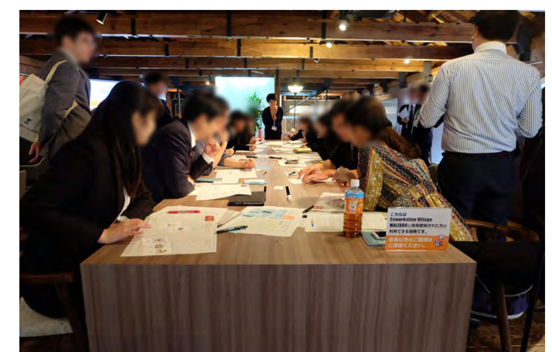
Held a WS for extracting latent issues by tools used in regional cooperation activities at IIS.