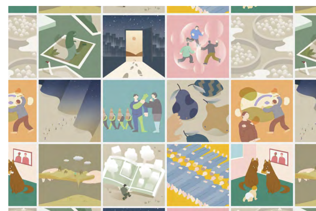
Held an Online WS for high school students across the country applying speculative design.